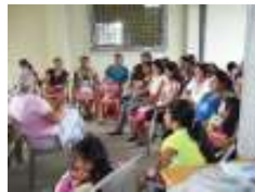
Cooking class at El Sinai Over 42 youth & ladies attended each day