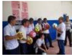
Presentation of sports equipment in Sonsonate, El Salvador